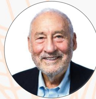
Joseph E. Stiglitz