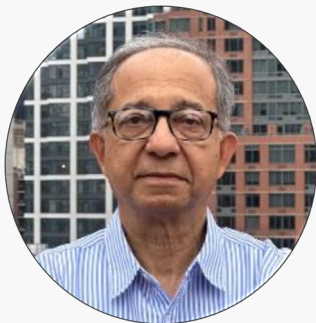
Kaushik Basu Co-Chair